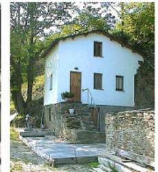
1 st step - renovation/transformation of the goat house into a living house - approx. 70m 2