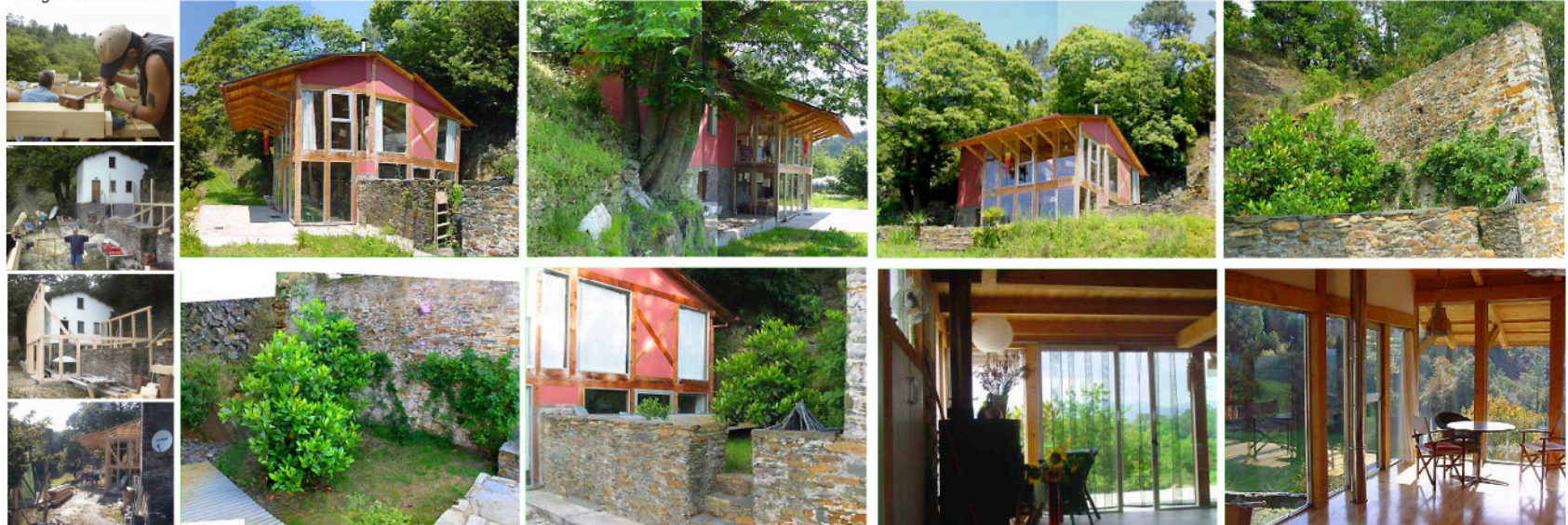
eight images of the finished studio.02 - approx. 70 + 70m 2